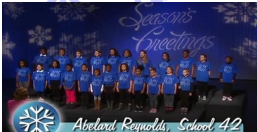
Pictured to the right is the School #42 Choir from when they played at PBS during the month of December, 2014